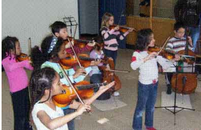
Violins and cellos playing together for the first time.

One, two, three, four; the students tap the rhythm out by hand. Two beats on their legs, one clap of their hands and a snap of their fingers.