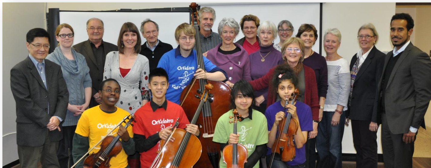
The Leading Note Foundation Board of Directors 2012-2013 with OrKidstra String Quintet