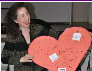
Trillium Recognition Event 2013